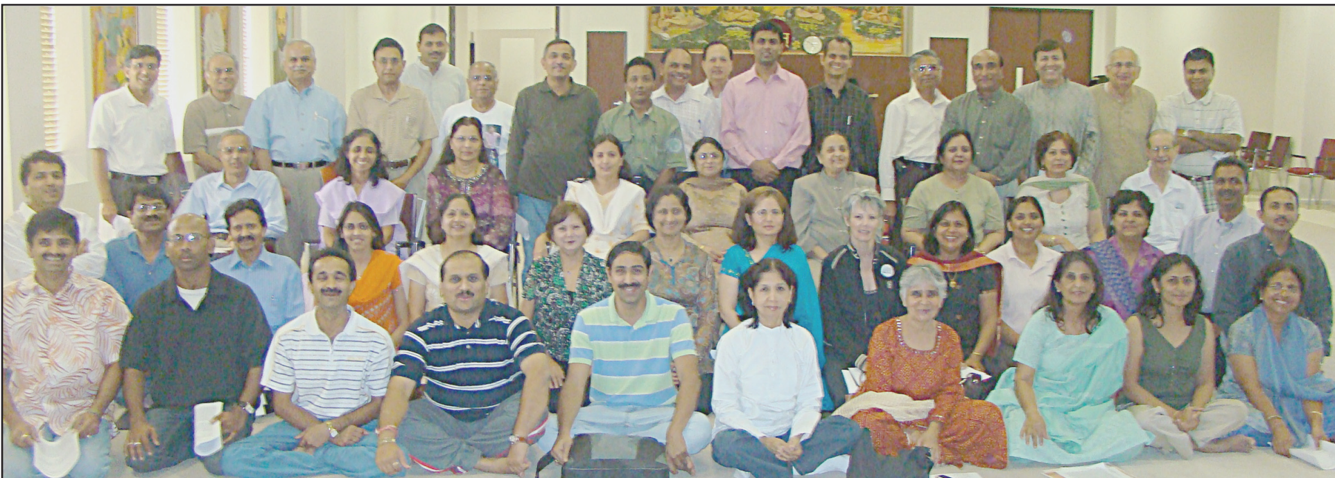
Above, Volunteers from the Houston area attend an orientation meeting for Swami Ramdev's the Yog Science Camp.